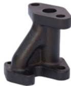
Y FLANGE BODY 20X20X10