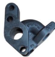
BRANCH PIPE TEE 45 DEGREE