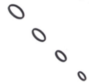
FLANGE GASKETS 3/8" 1/2" 3/4" 1" 1.25"