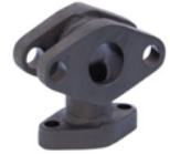
LARGE TEE BODY 32X32X25