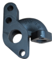
BRANCH PIPE TEE 90 DEGREE