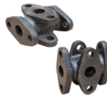
4-WAY TEE BODY 20X20X20X20