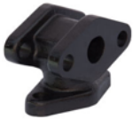
SMALL TEE BODY 20X20X20