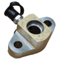
BRAKE CYLINDER TEST POINT FLANGE